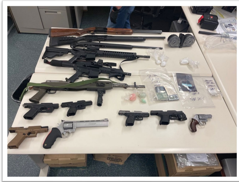
Items seized from April 2025 search warrant in 1200 block of Gates Street, Aurora